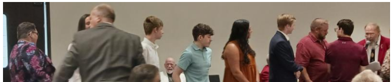
About 1/3 of our scholarship recipients were present to be introduced to the crowd at the Grand Convention Banquet... A highlight of the banquet!